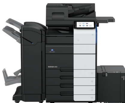
bizhub i-Series C650i