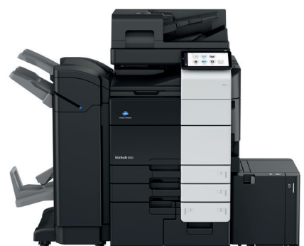
bizhub i-Series 950i